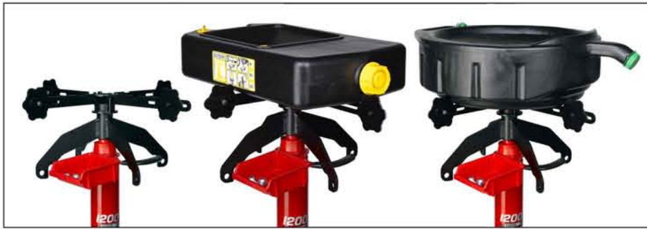
A-5184 Adjustable support for oil-collection containers of different formats or diameters. Maximum diameter 485 mm. Optional.