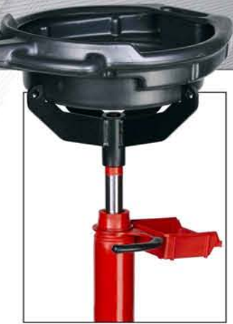
Newly designed support for holding oil containers.