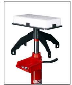
A-5183 Block of protective foam. Optional.