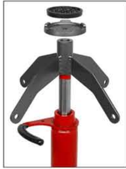
C-17 Extra saddle. Optional.