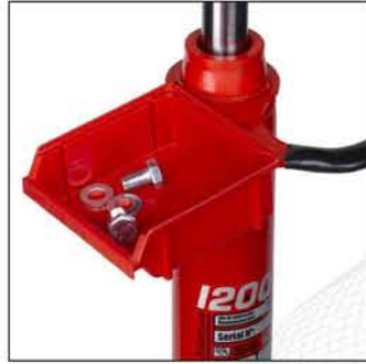
A-5187 The rotating handle can hold a box for screws. Box optional.