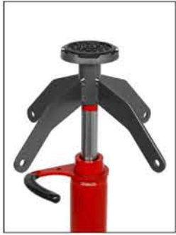
A-5181 Rubber pad for the saddle. Optional.