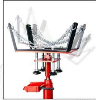
PF-1200A Adjustable saddle with chains. Optional.