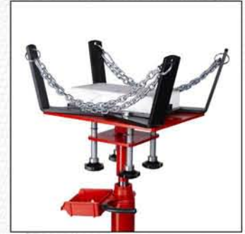
PF-1200A Block of protective foam (A-5183). Optional.